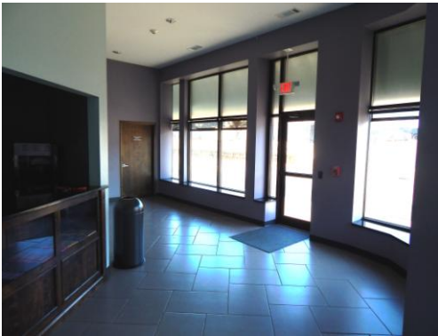
Arts Center Entrance

The lobby is of comfortable size with beautiful floor-length windows and a concessions area. The box office location works out of the same concessions area and is easily accessible in the lobby. Women's and men's restrooms are conveniently located in a hallway just off the right side the lobby. Also located along the same hallway the is the Elberton Arts Center kitchen area equipped for food service with a sink with hot and cold water, a refrigerator, a dishwasher, prep-work counter space, several outlets for warming trays/food processors and a working gas stove.