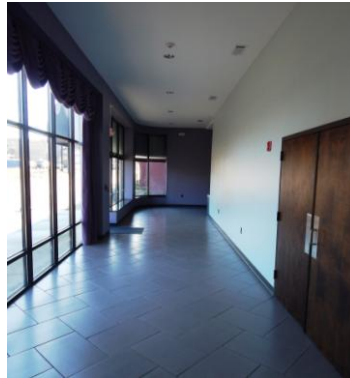
Arts Center Lobby