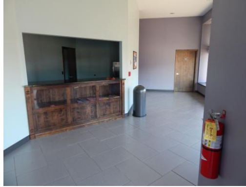
Box Office and Concessions Area

The lobby is of comfortable size with beautiful floor-length windows and a concessions area. The box office location works out of the same concessions area and is easily accessible in the lobby. Women's and men's restrooms are conveniently located in a hallway just off the right side the lobby. Also located along the same hallway the is the Elberton Arts Center kitchen area equipped for food service with a sink with hot and cold water, a refrigerator, a dishwasher, prep-work counter space, several outlets for warming trays/food processors and a working gas stove.